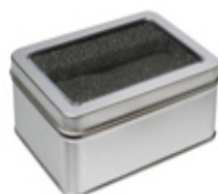
Tin 03 - Large